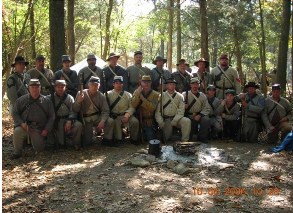
19th Alabama Co I. at Perryville 2006