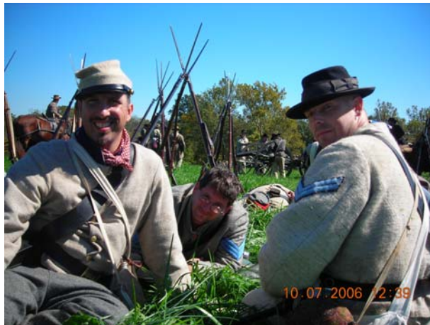
Taking a break at Perryville 2006.